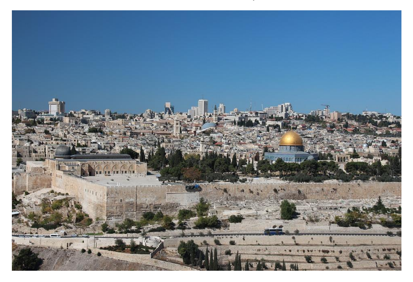
Kislev 18 / November 25, 2018

"But when you see the abomination of desolation standing [in the temple sanctuary] where it ought not to be (let the reader understand) then those who are in Judea must flee to the mountains.