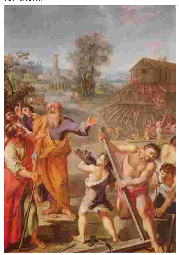
17 Mar-Cheshvan (circa 2105 BCE)

It is as though the Jewish destiny has seen fit to give us a month off, a time to return to ourselves and our daily lives, to place into daily practice the great lessons afforded us by the challenges of the two previous months. It is as though God says to us, so to speak, "My children, let Me see how you put into your daily lives the holiness and commitments that you accumulated during the months of holidays and the preparation for them."